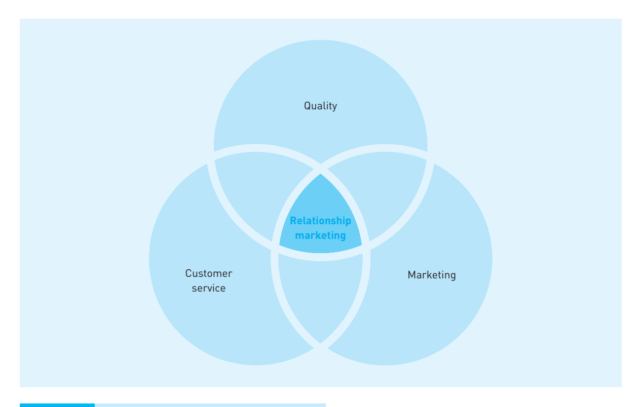
FIGURE 12.1 Relationship marketing, quality and service

The key to relationship marketing is understanding that customers are buying a bundle of benefits, some of which include such factors as product reliability and a pleasant service from the company they are dealing with. Increasingly, customers are expecting suppliers to value their custom; during the 19th century, every shopper would expect the shopkeepers to know them by name, to be respectful and polite, to anticipate their needs, and to arrange delivery or otherwise show that they regarded the customer as important to the firm. As firms have grown bigger, this level of personal attention has largely disappeared. Economic forces have removed the old systems from grocery shops, so that customers are now expected to find the goods themselves, carry them to the